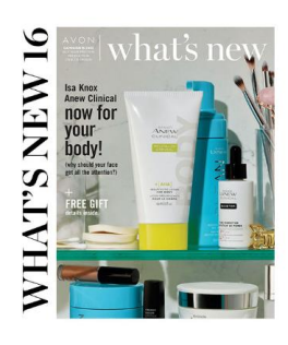
New! Digital Brochure Shoppable, browsable, virtual try-ons and more!