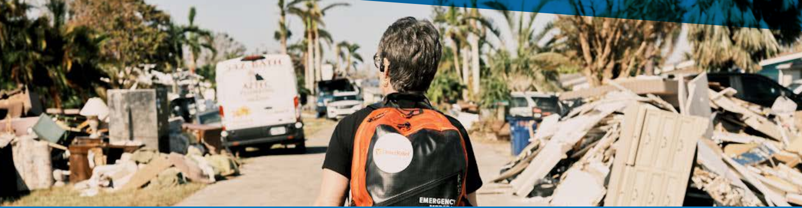
DIRECT RELIEF Emergency Medical Response Backpack used in Florida after Hurricane Ian in September 2022.